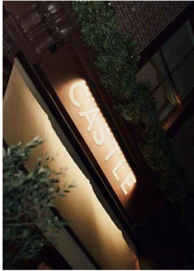
The Walmer Castle