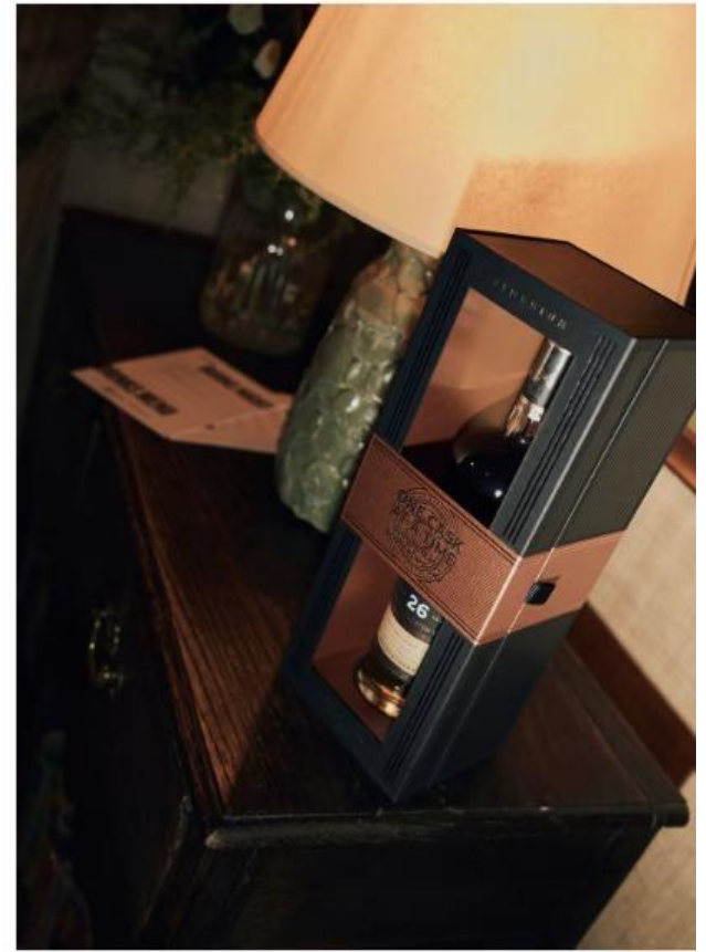
One Cask at a Time