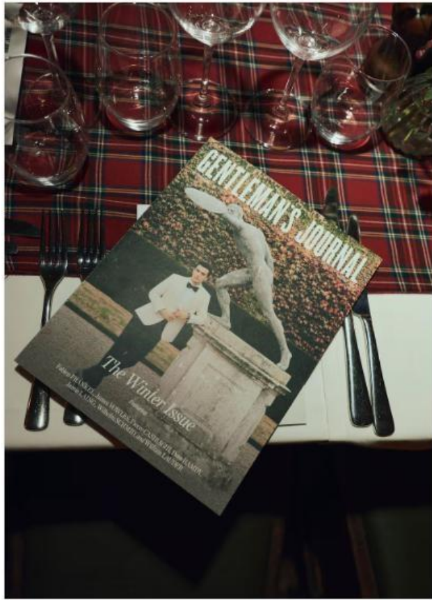
Gentleman's Journal Issue 49