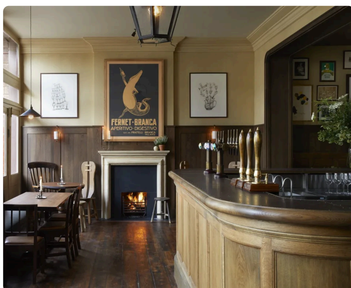
The Walmer Castle

The Walmer Castle , 58 Ledbury Rd, London W11 2AJ