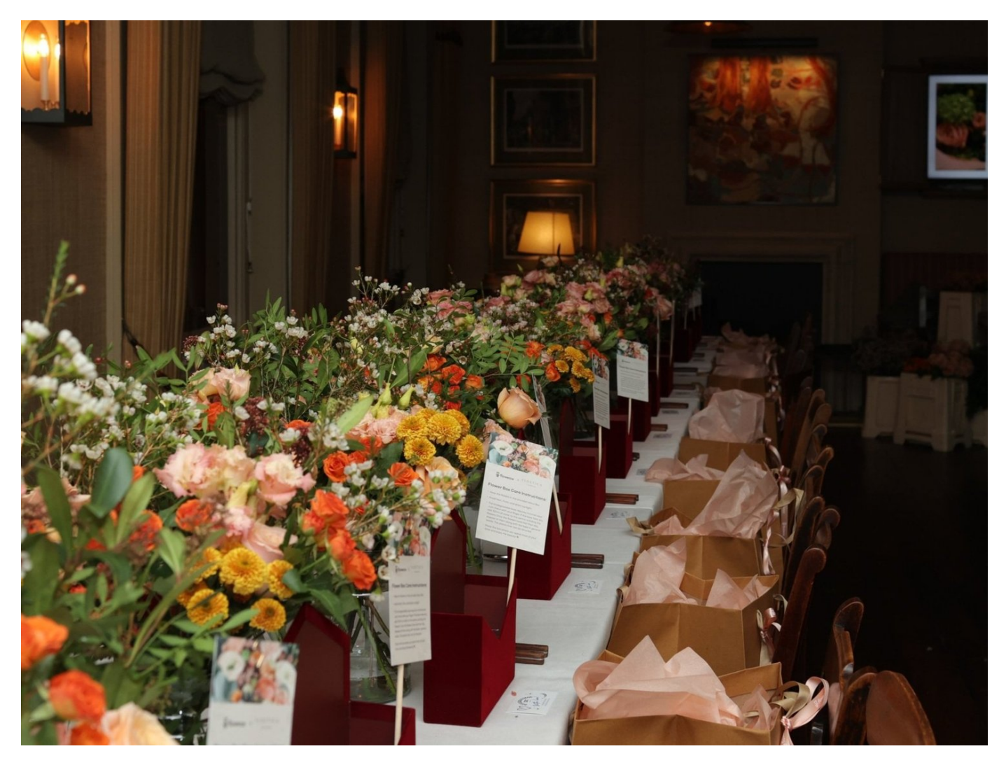
A night of flower power at The Walmer Castle to launch the Neighbourhood Edit x Flowwow collection

As champions of local enterprises with a global heart, we are very excited to announce our collaboration with gifting gurus Flowwow. We have teamed up with the marketplace, which works with local florists, patisserie chefs and makers across the world, to curate our very own collection of floral bouquets for Valentine's Day.