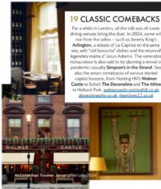
46 Condé Nast Traveller January/February 2024